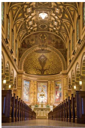
Photo: Church of St. Ignatius Loyola, location of the Pueri Cantores Festival & Mass in New York.

The 2009-2010 Festival season is wrapping up with the following upcoming festivals: